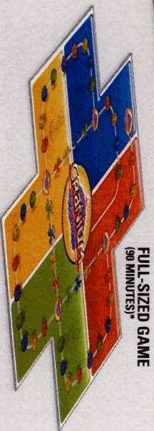
FULL-SIZED GAME (90 MINUTES)*

*This is our best guess. Actual game times may vary depending on luck, adequate and/or distracting snacks, and the overall brilliance of the players.